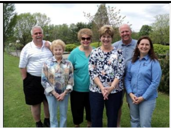
BB Western PA Golf Outing Committee

In speaking with the interim pastor at Trinity, we have been told that their are anywhere from 3 to 10 BB recipients attending their Thursday evening casual church service.