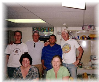
Volunteers at the Lemoyne site

The Bountiful Blessings Lemoyne site was the first Bountiful Blessings site opened. The site is located inside Trinity Lutheran Church at 509 Hummel Ave. in Lemoyne.