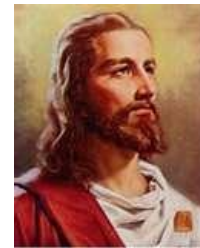
Jesus Christ CEO