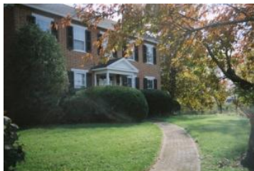
The Bountiful Blessings office

Proceeds from the golf outing were used to support the western PA Bountiful Blessings sites.