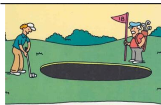
The 18th hole at Fantasy Golf Camp.

To view photos of the event, go to the BB web site and click on EVENTS.