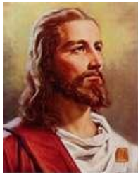
Jesus Christ - CEO