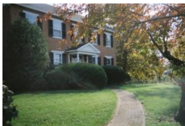
The Bountiful Blessings office

Contact our office, and a staff member will offer their advice and expertise on how to do a non-food drive.