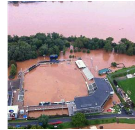
Metro Bank Park where the Harrisburg Senators play ball was under water

Go out every day and dedicate your actions to others.