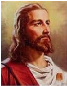
Jesus Christ - CEO